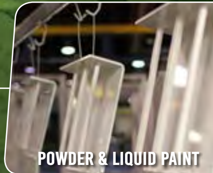
POWDER & LIQUID PAINT