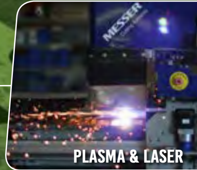
PLASMA & LASER